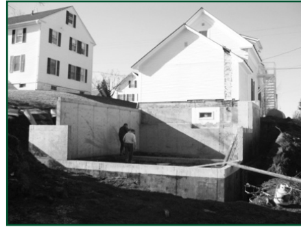
November 18 Status Foundation poured