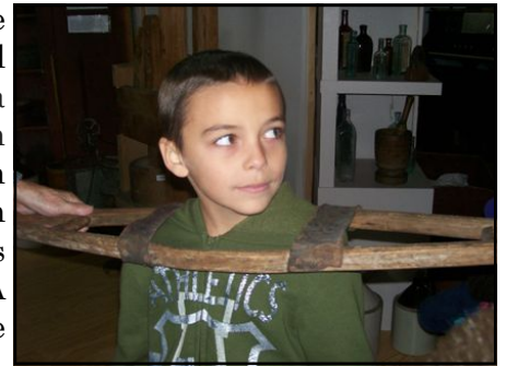
Student wonders how the yoke would feel loaded with buckets of sap

furnished in advance and each pair of students had questions to answer from the display. A favorite activity was to find the objects they had pictures of and guess what their uses were. They also loved looking through our stereoscope and trying on the yokes in the "barn" used to carry buckets of water or maple sap.