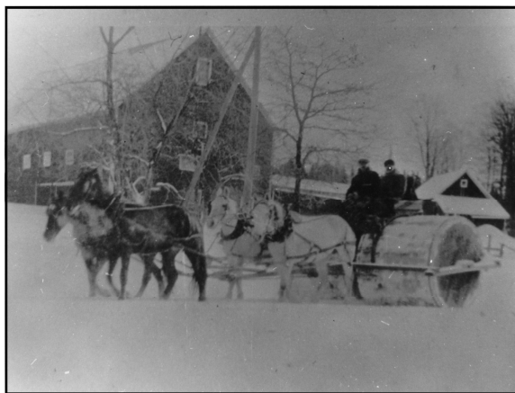
Before 1930 this snow roller was used to "plow"

On Sunday, March 3, the Greensboro Historical Society's winter program will focus on Greensboro roads, from "old" roads to those of today, how they have changed and why. Come share your memories and family stories about traveling in and around Greensboro over the years, before and after paving, with and without plow trucks, from winter isolation to year-round motorized travel.